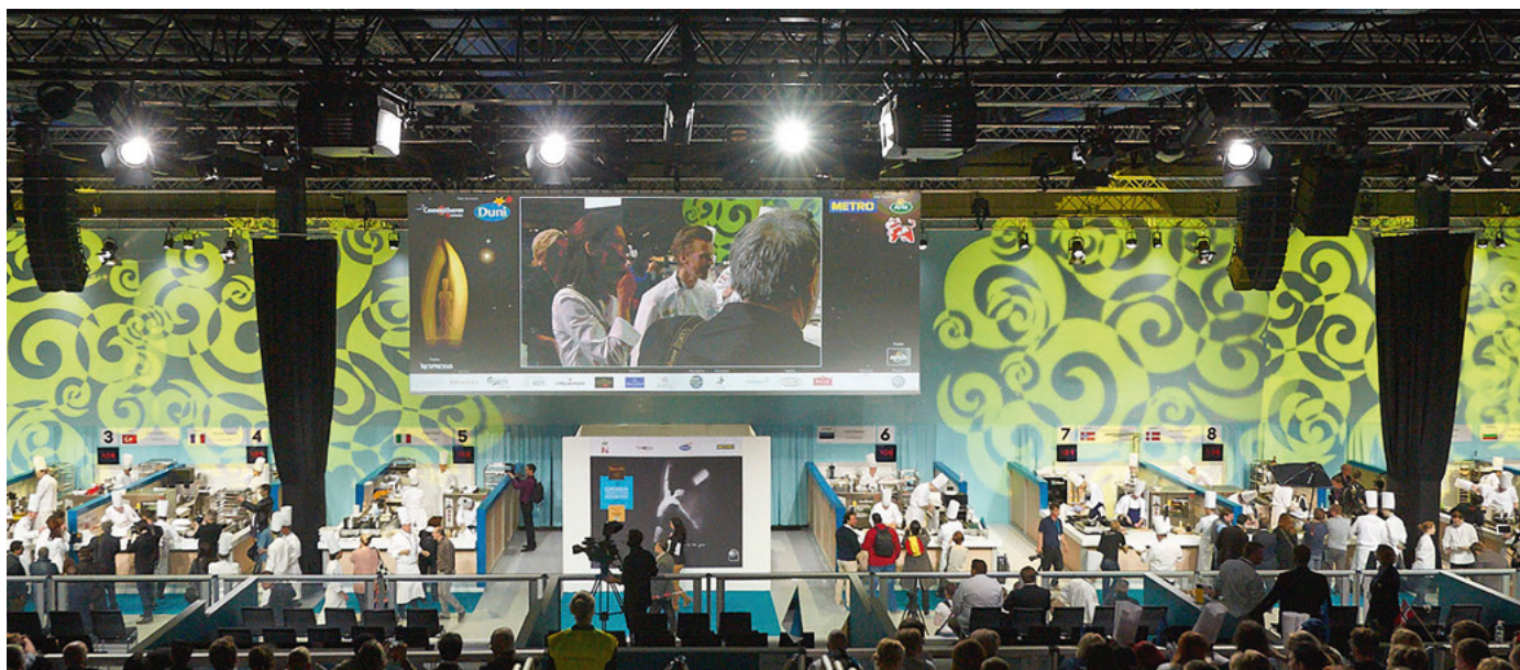
Bocuse d'Or Europe 2014 - Stockholm